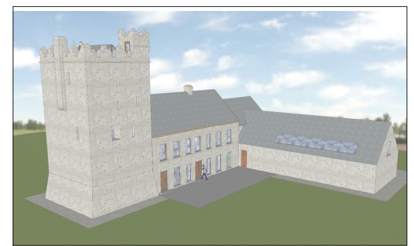
3D Impression South East View