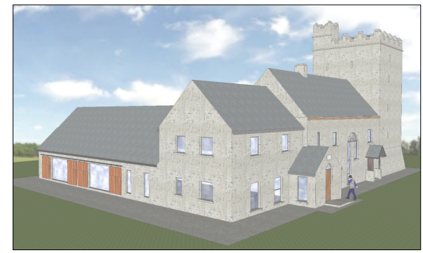
3D Impression North West View